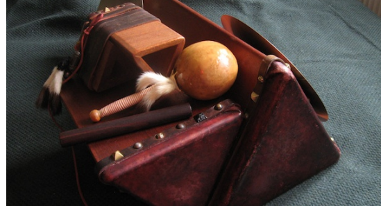
Fig. 3: Trimba pictured with a conjoined woodblock and dragon's teeth on top of the smaller trum , referred to as the attachment .

Fig. 2: Trimba pictured with mallets and only the dragon's teeth on top of the smaller trum .